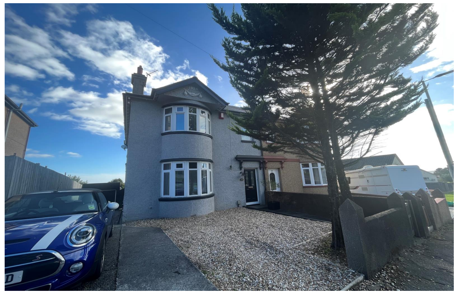
Tavistock Road, Crownhill, Plymouth, Devon, PL6 5EJ

Impressive Bay Fronted Semi Detached Home in Sought After Area