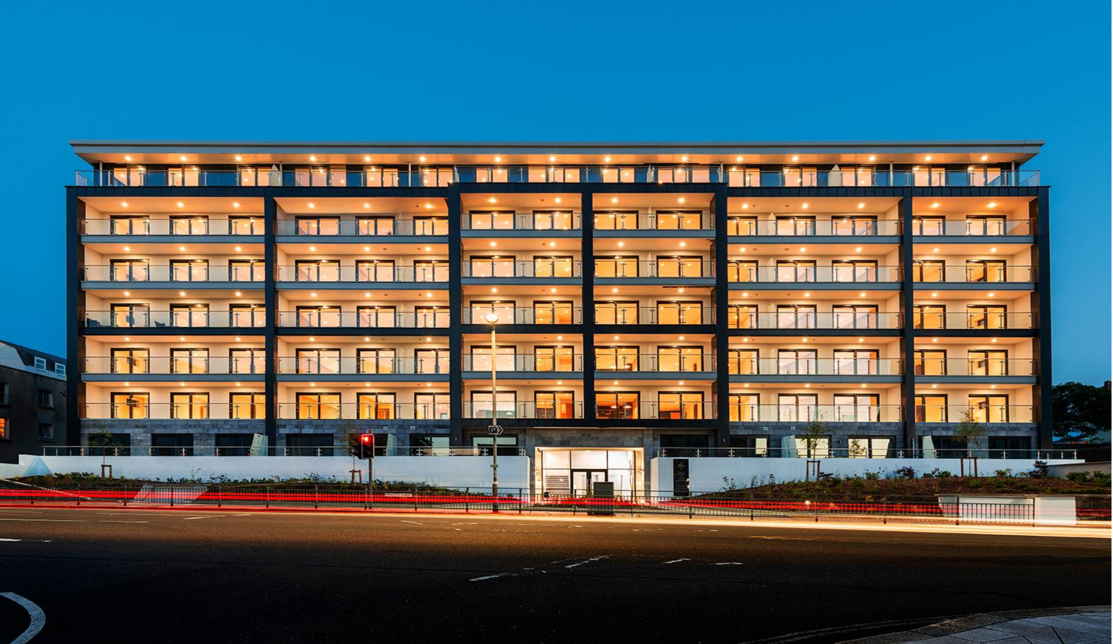
Peirson House, 175 Notte Street, The Hoe, Plymouth, Devon, PL1 2DT