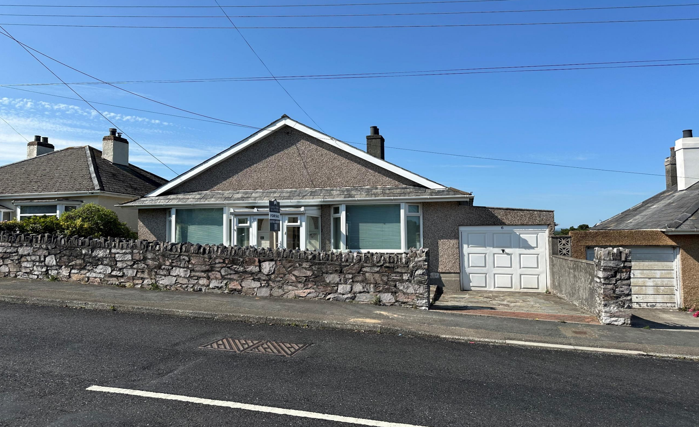
6 Underlane, Plymstock, Plymouth, Devon, PL9 9JX