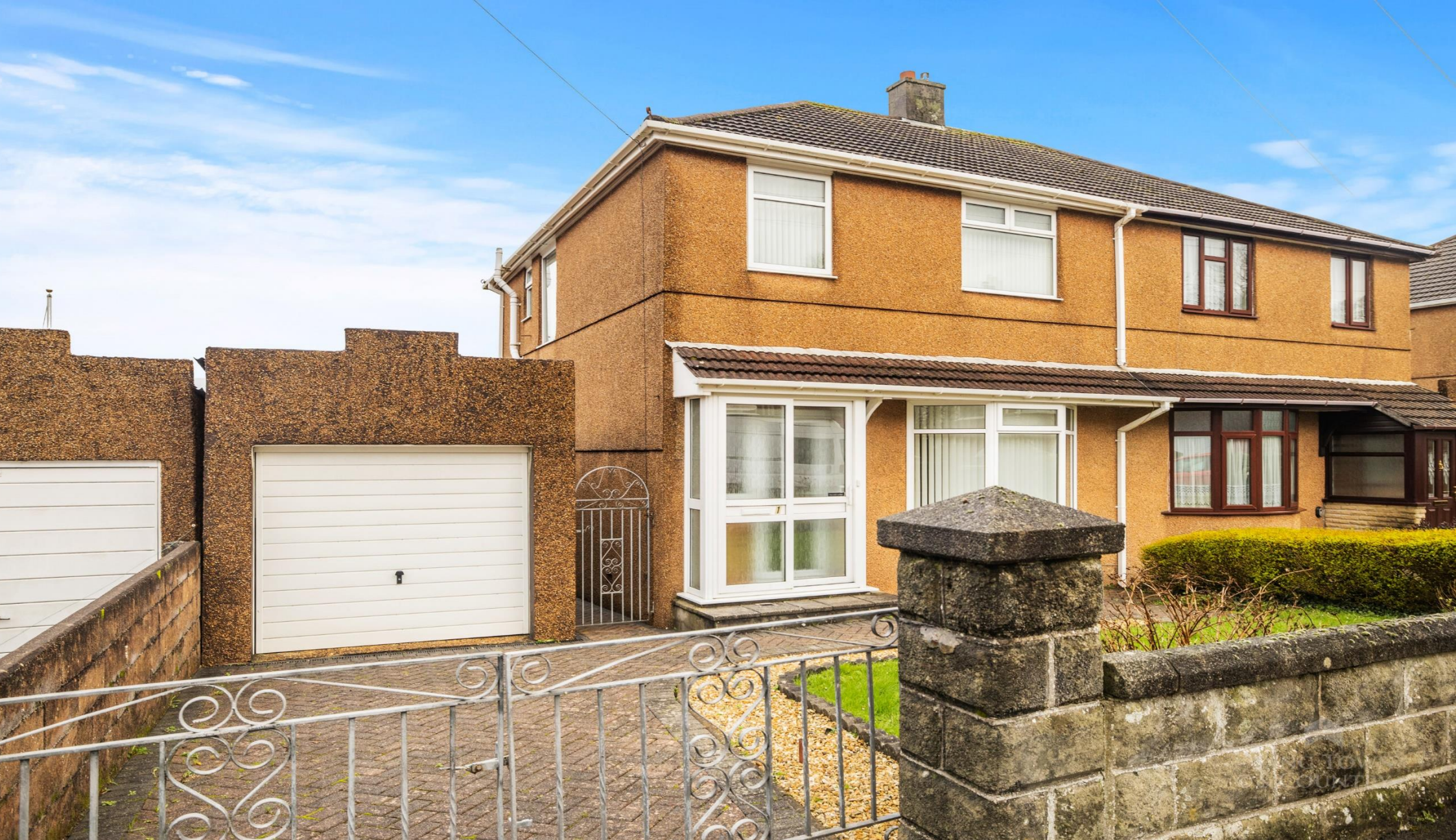
1 Caernarvon Gardens, Beacon Park, Plymouth, Devon, PL2 2RY