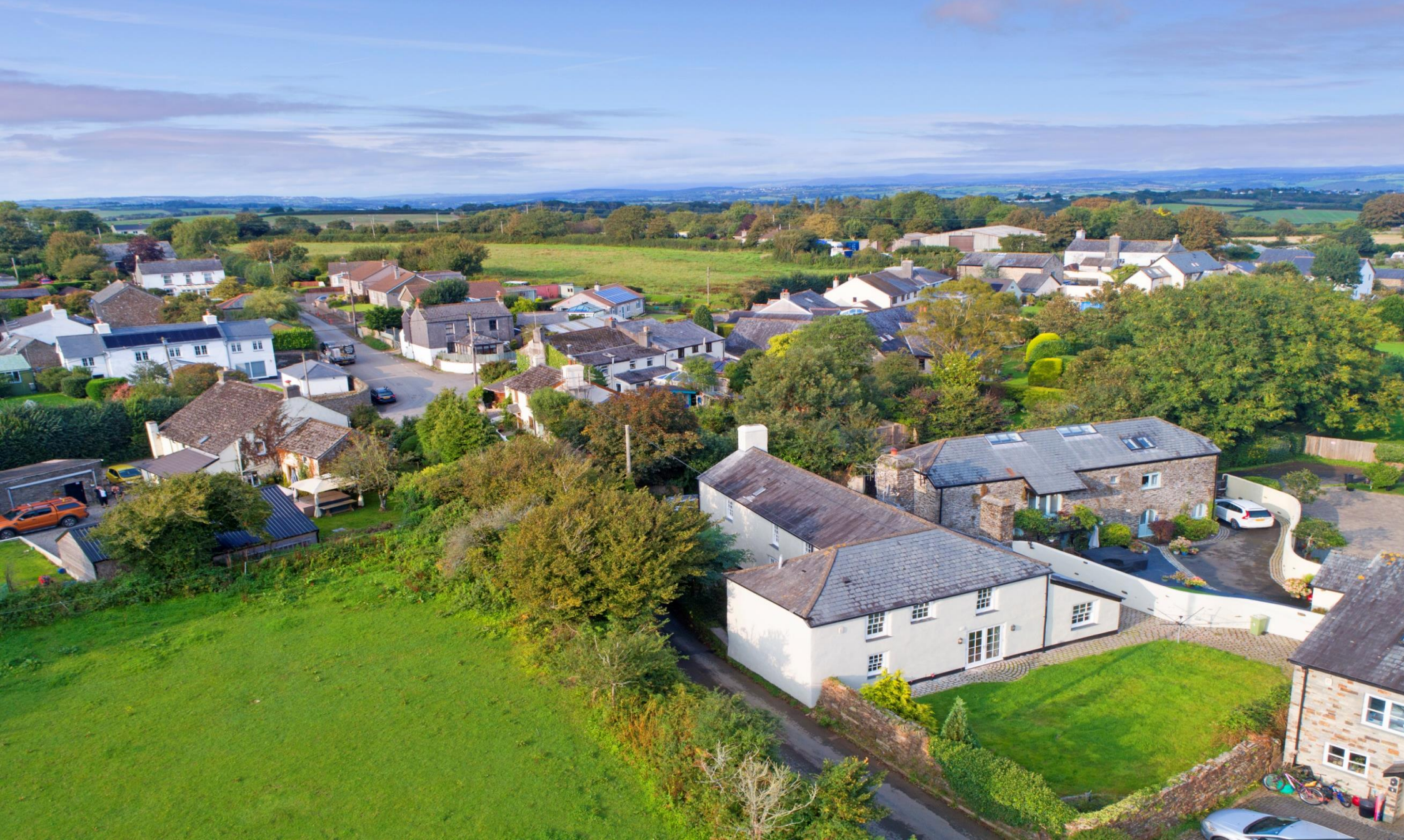
The Old Farmhouse, Trematon, Saltash, Cornwall, PL12 4RU