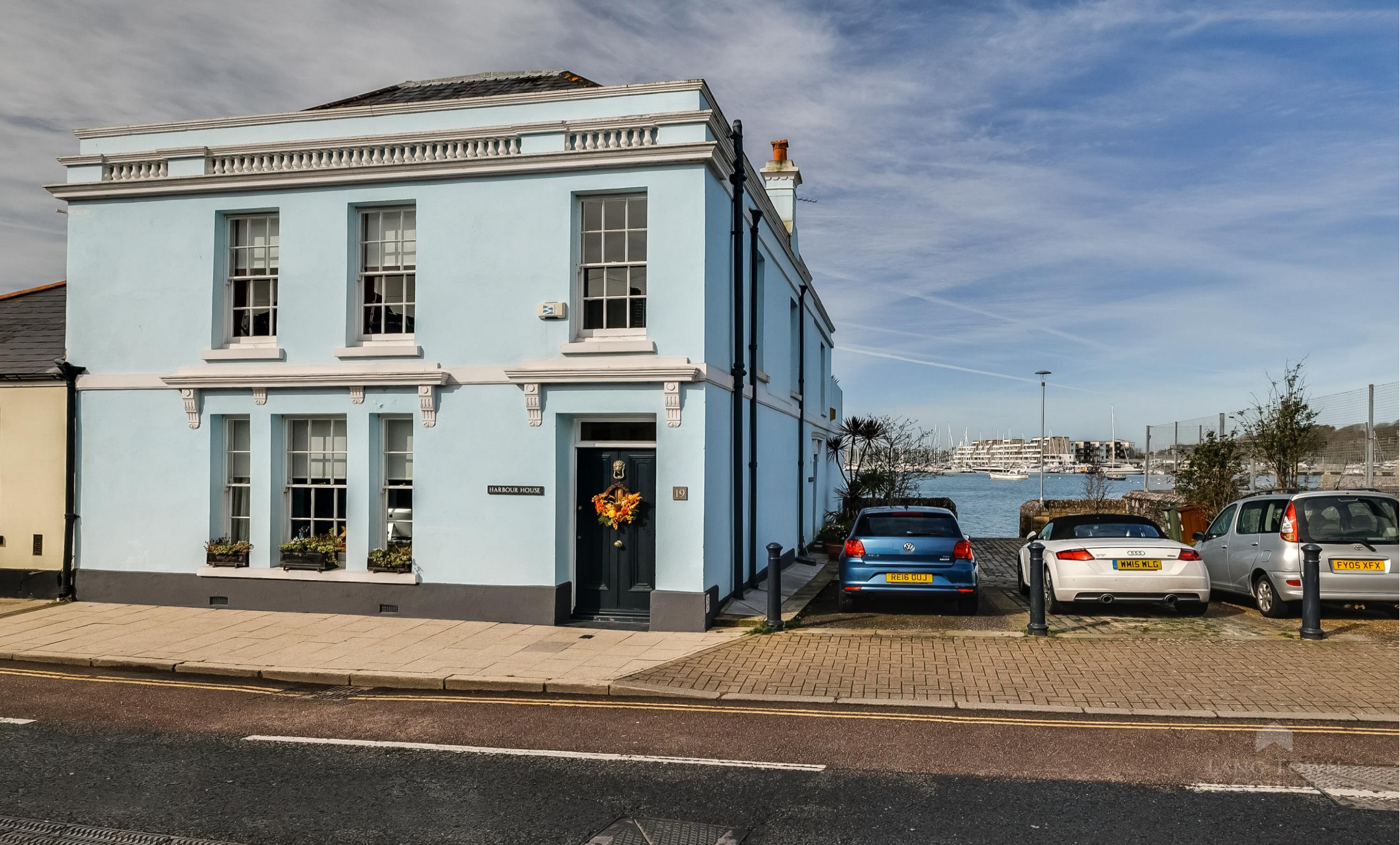
Harbour House, 19 Cremyll Street, Stonehouse, Plymouth, Devon, PL1 3RB