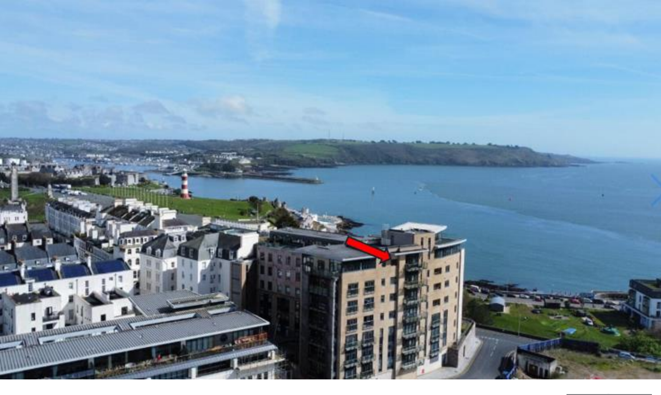
Flat 49, Azure, 55 Cliff Road, The Hoe, Plymouth, PL1 2PE