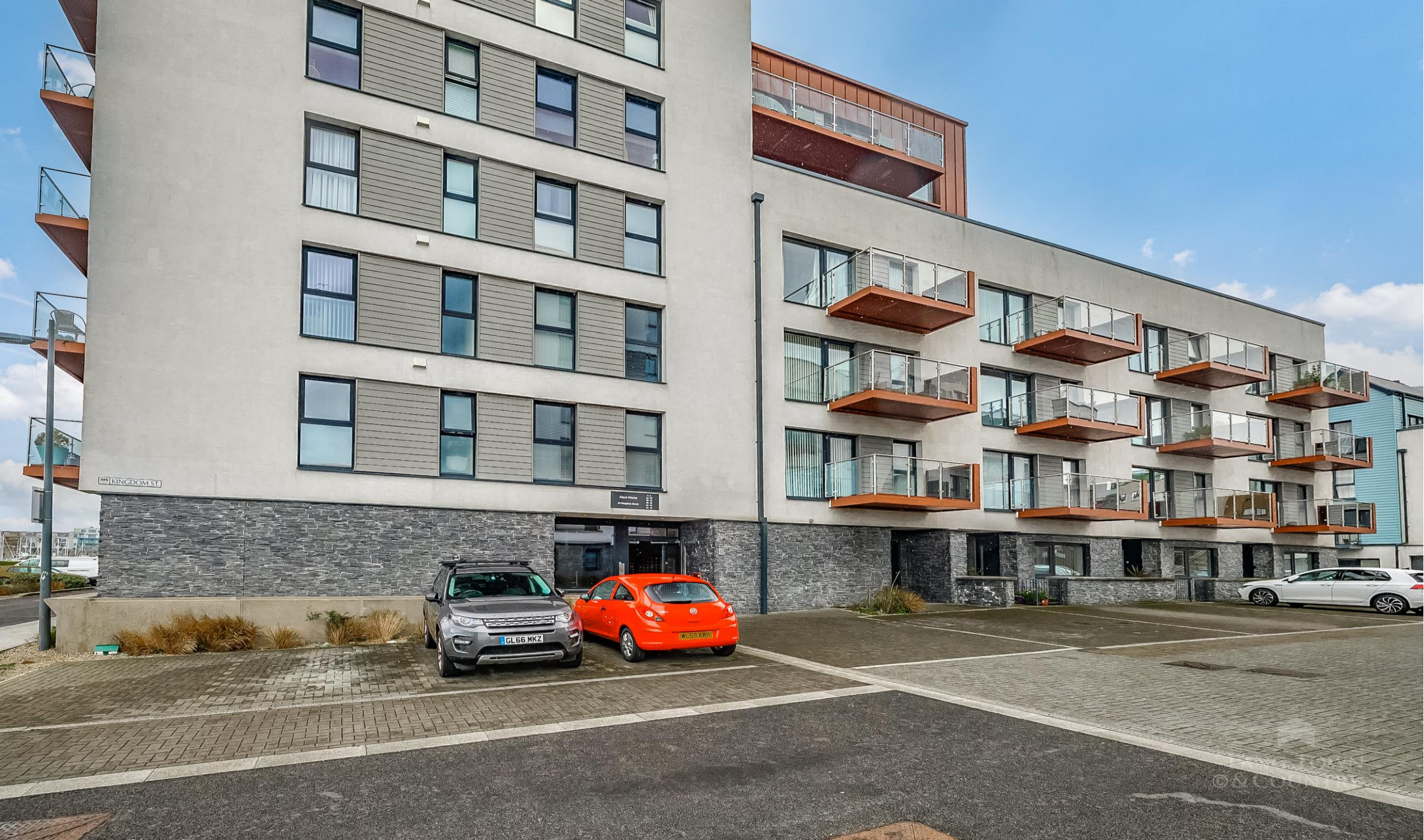
Flat 66 Aqua House, 1 Kingdom Street, West Hoe, Plymouth, Devon, PL1 3GJ