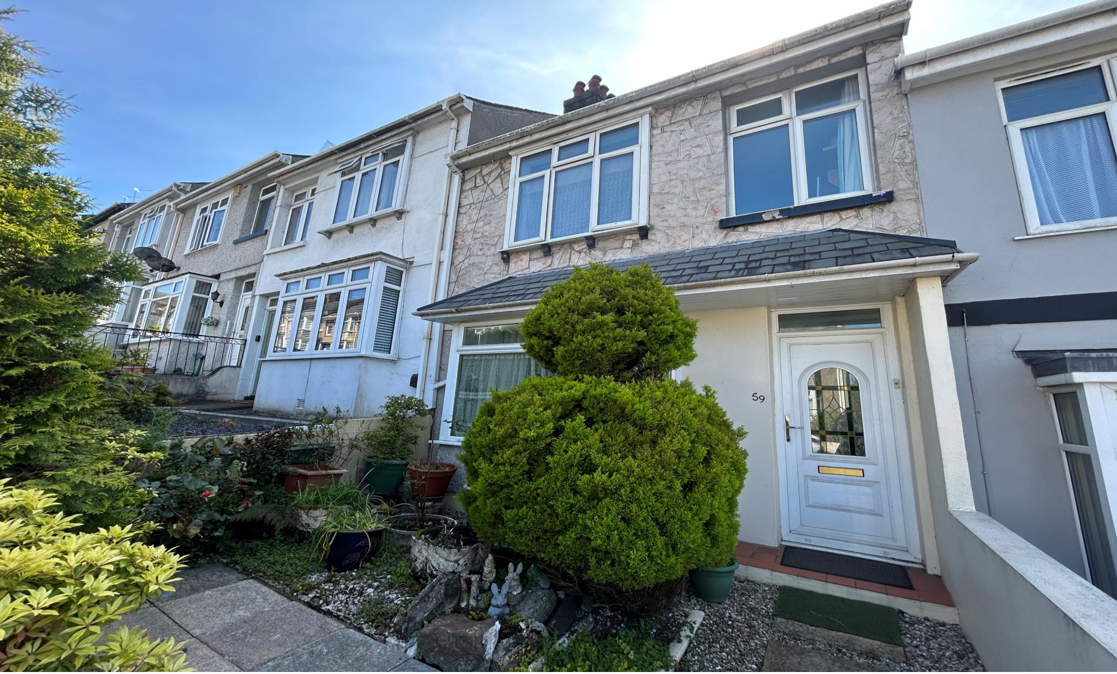
59 Sturdee Road, Milehouse, Plymouth, Devon, PL2 3AT