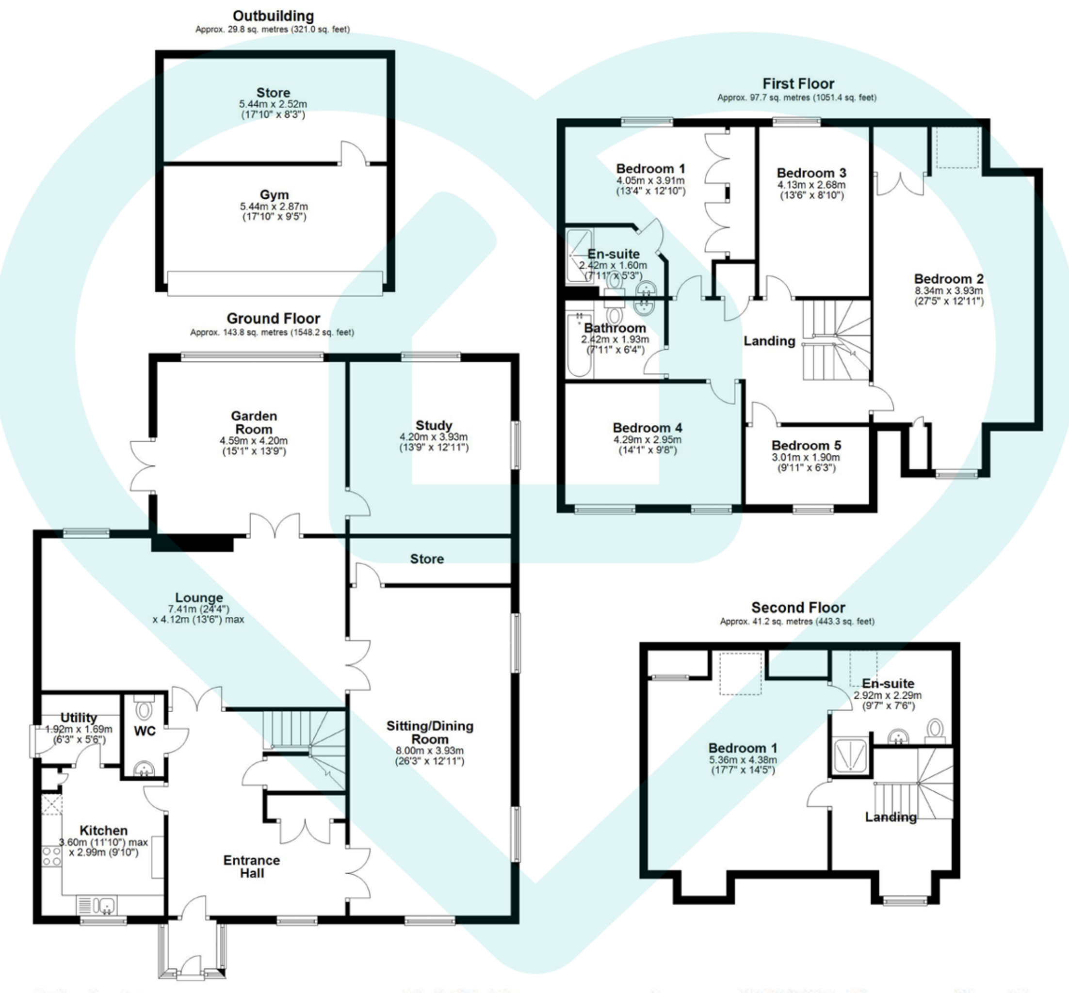
Total area: approx. 312.5 sq. metres (3363.9 sq. feet)

This floor plan is for illustrative purposes only. All measurements and layouts are approximations and do not necessarily capture the precise specifications of the property. No responsibility is taken for any error, omission, or misstatement. We always recommend viewing in person to confirm the exact floor plan of a property. Made with Metropix.